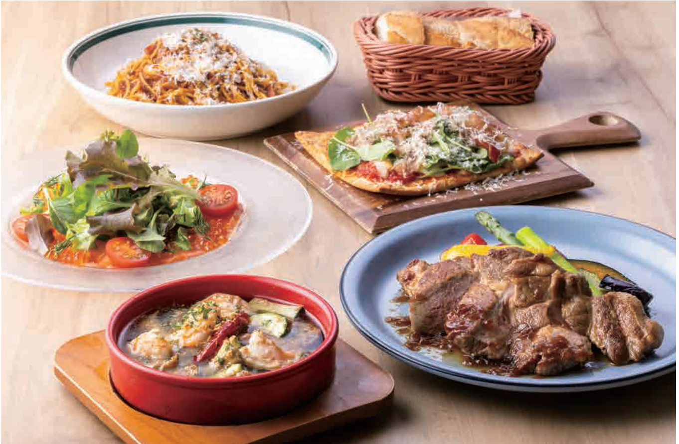
Casual share course 2people