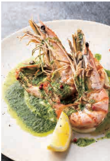
Grilled Prawns with Herb Butter Sauce ¥1,700