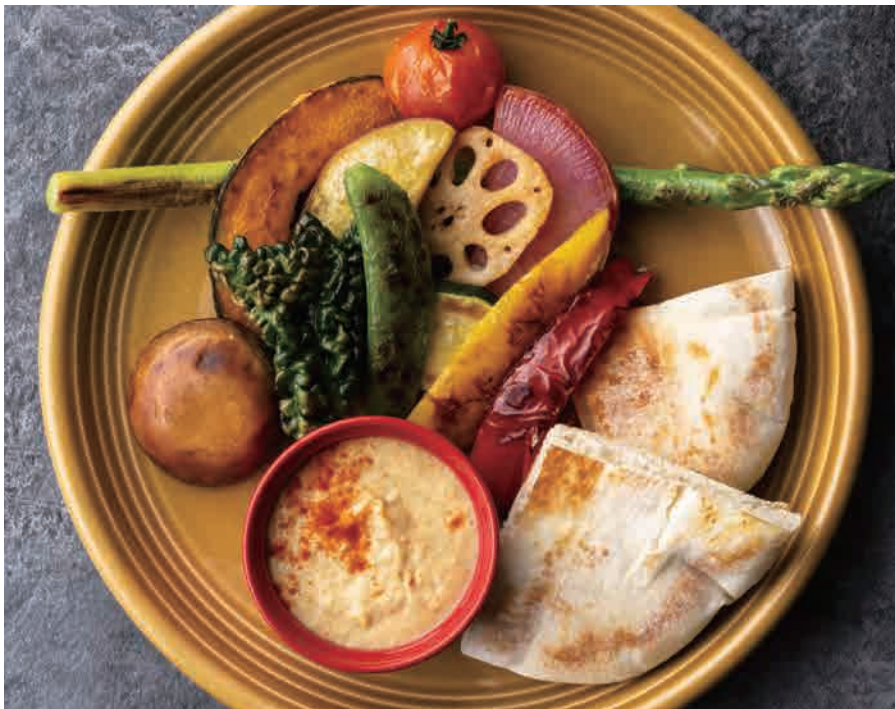
Hummus (V) ¥1,200