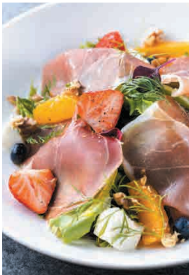
Baby Leaf Salad with Prosciutto and Seasonal Fruits ¥1,600