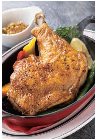
Grilled Chicken- on-the-bone ¥2,300