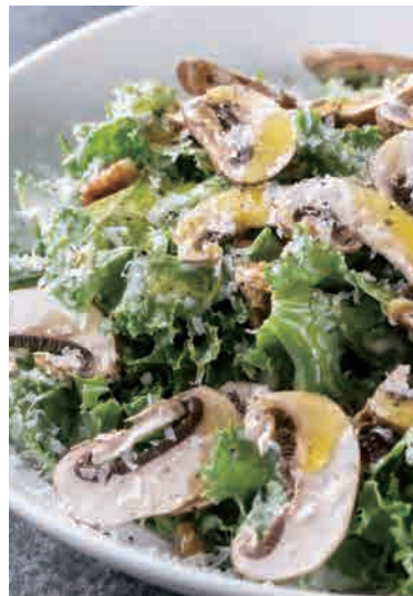
Kale and Mushrooms Salad ¥1,200