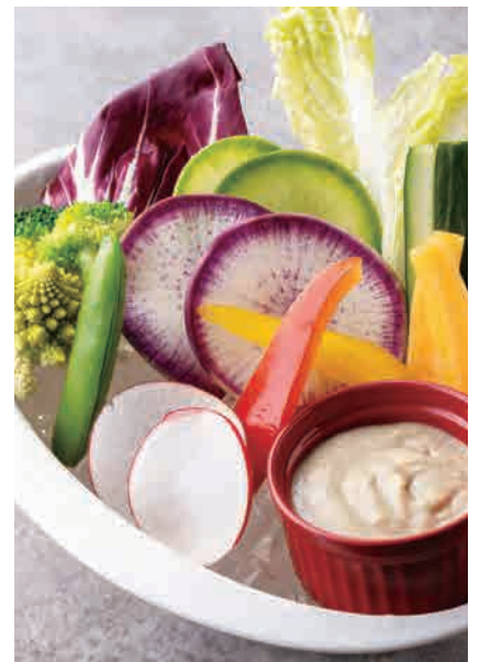
Bagna cauda (cold) ¥1,200