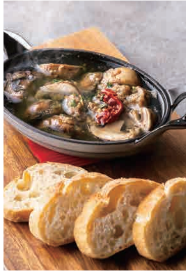
Mushrooms Ajillo ¥1,100