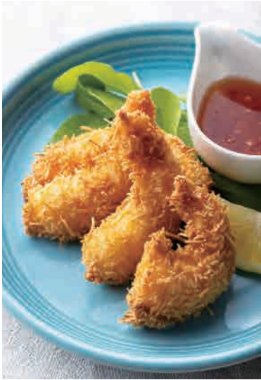
Coconut shrimp with sweet chili sauce ¥1,300