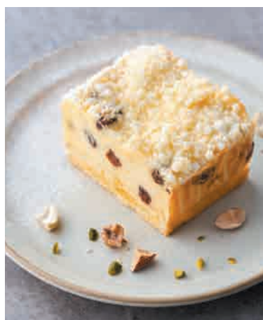
Premium Baked Cheesecake