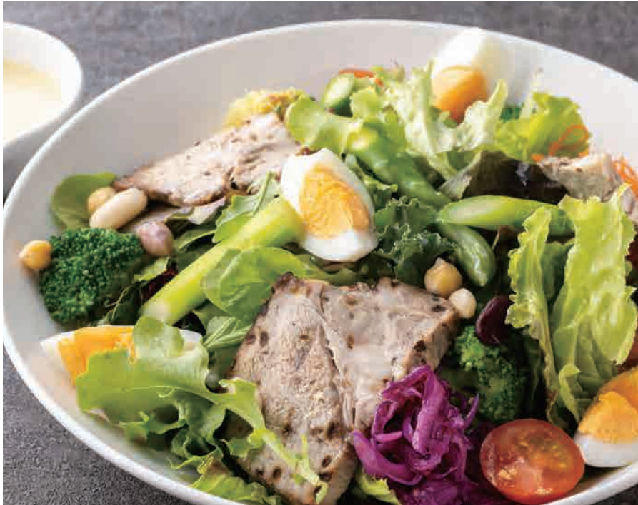
Salad with Grilled Rost Pork ¥1,700