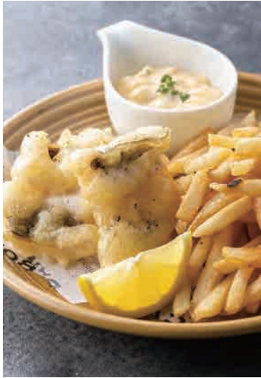
Conger eel fish and chips ¥1,200