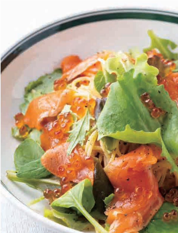
Cod Roe Cream Sauce Pasta with Smoked Salmon and Salmon Roe ¥1,900