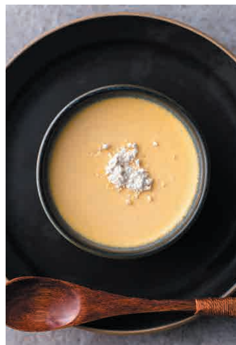
Baked Sweets Plate