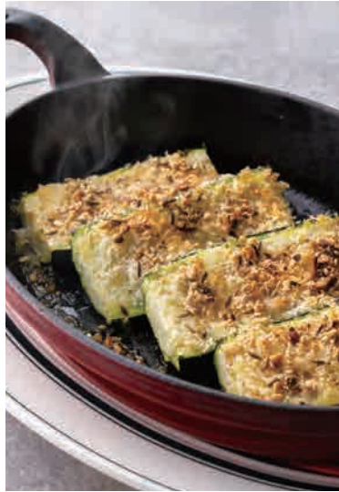
Baked zucchini with Dukkah spice bread crumbs (V) ¥900