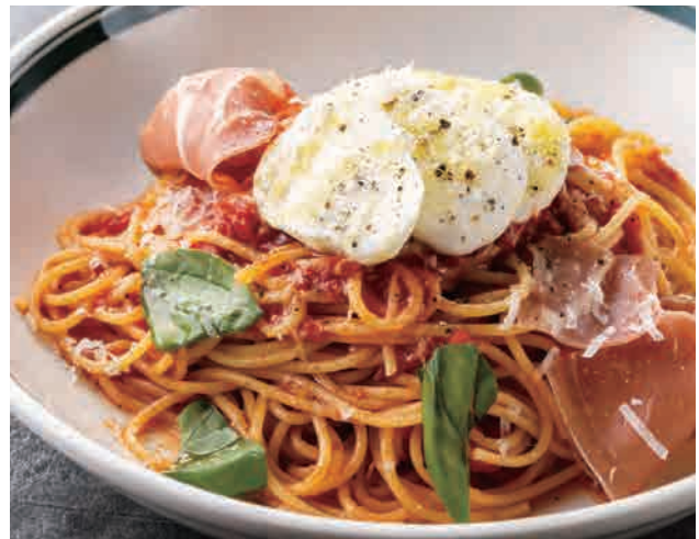
Pomodoro with Mozzarella and Prosciutto ¥1,900