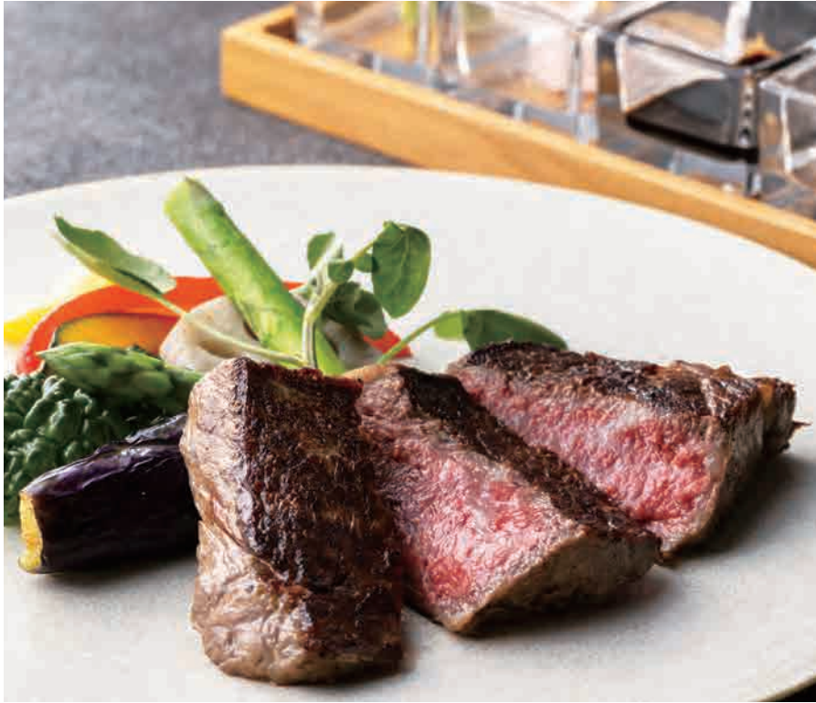
Sirloin Steak 150g ¥3,900