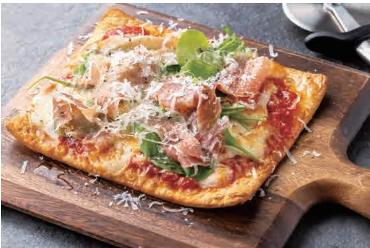
Whole Wheat Bread Pizza with Prosciutto and Arugula ¥1,400