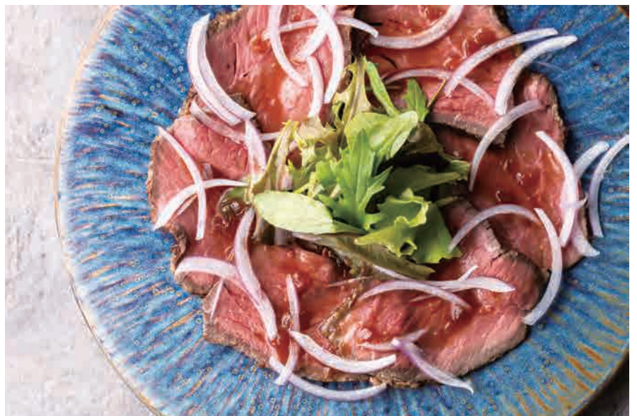
Roast Beef (cold) ¥2,000